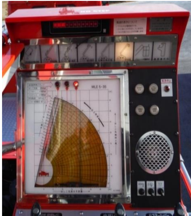
Fig. 5. Mechanical display panel