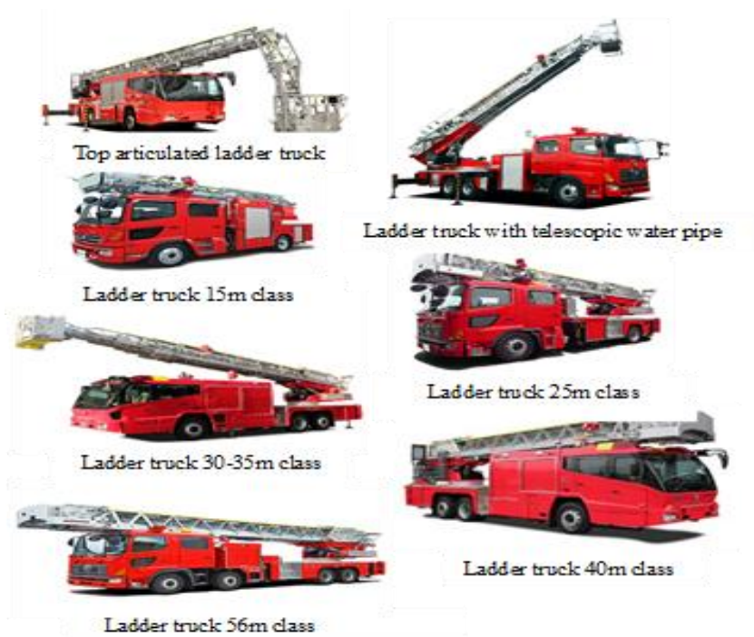
Fig. 1. Super Gyro Ladder Series