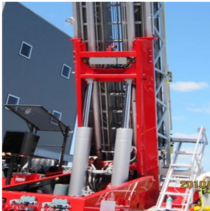
Fig. 4. Paired derricking cylinders