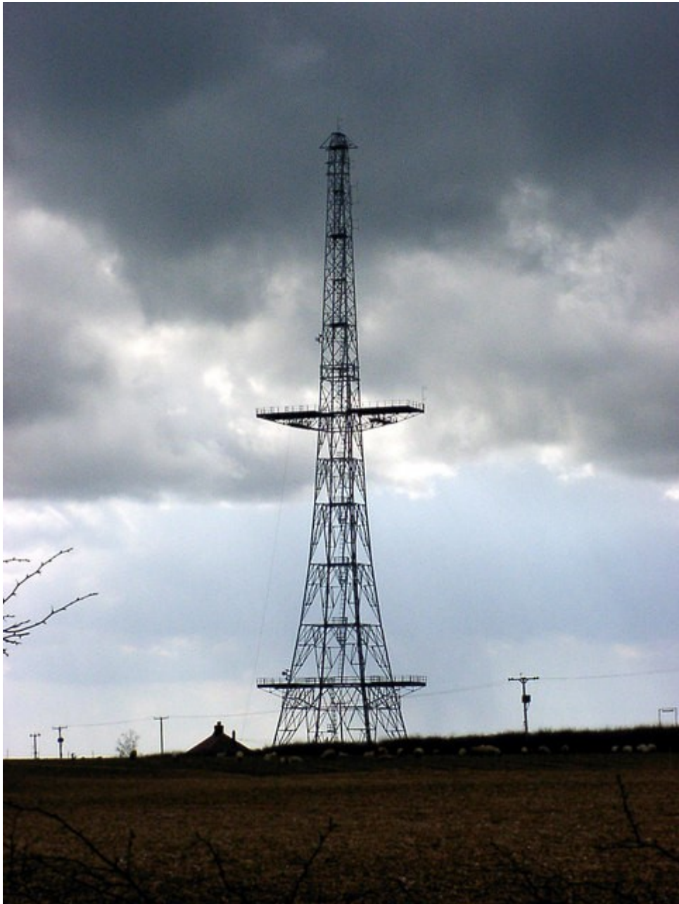
Chain Home RADAR tower, courtesy Wikipedia