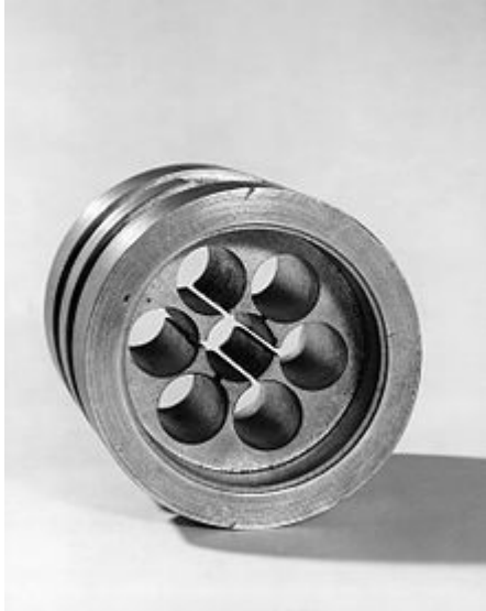
The anode block of an early cavity magnetron as built by Randall and Boot showing the initial 6 cavity resonators