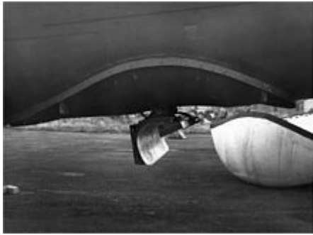
H2S RADAR scanner fitted below an aircraft where the dipole antenna is replaced with a waveguide and reflector