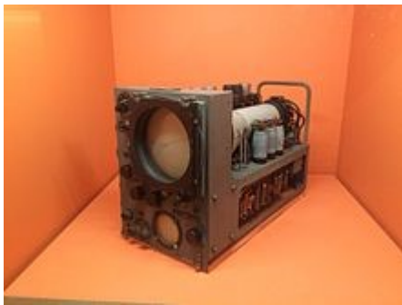
H2S RADAR display unit as flown during World War 2