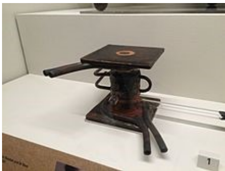
Randall and Boot 's original 1940 cavity magnetron, courtesy Wikipedia.