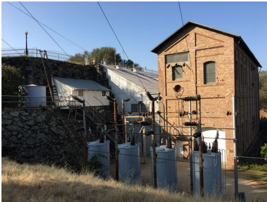
Folsom Powerhouse.

According to Carron Garvin of the American Society of Mechanical Engineers, when the Folsom Powerhouse “was placed in service [on the American River] July 13, 1895, it represented a momentous advance in the science of generating and transmitting electricity.” The new facility “brought high-voltage alternating current over long distance transmission lines for the first time.”