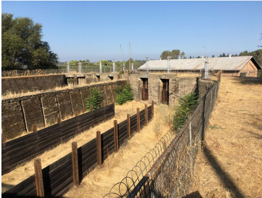
Folsom Powerhouse Forebay.