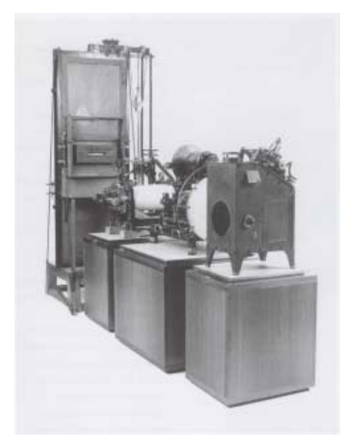
Figure 2 The Complete Constellation of Einthoven's Cardiograph, as Preserved in Museum Boerhaave

expectations were expressed in his first publication on the string galvanometer.<sup>8</sup> In this article he expected this new method to make it possible, better than before, to study all kinds of electrical phenomena of muscles, glands, nerves and senses. This description shows that Einthoven thought that his instrument could be used across the whole experimental field of physiology.