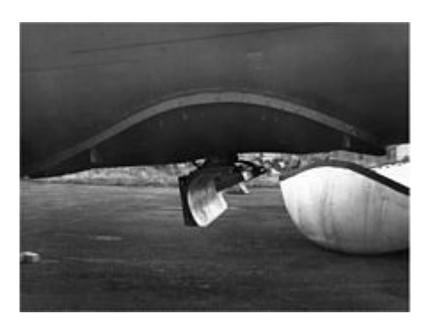
H2S RADAR scanner fitted below an aircraft where the dipole antenna is replaced with a waveguide and reflector, courtesy Wikipedia