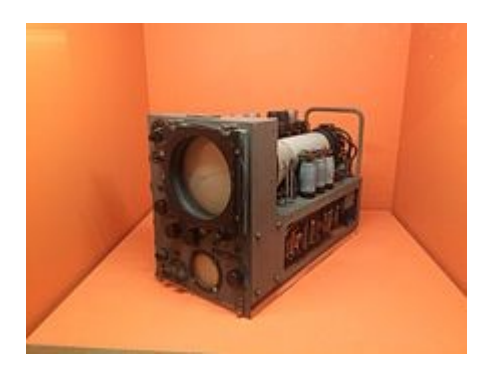
H2S RADAR display unit as flown during World War 2