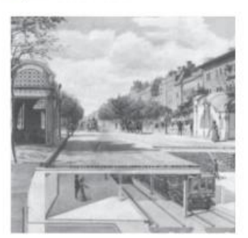
Figure 6.3 Budapest Metro, Line 1 c. 1890